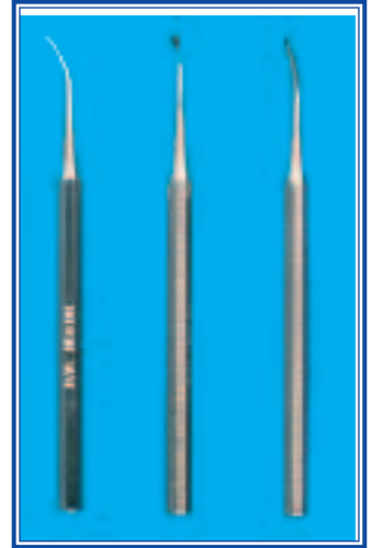
STAINLESS STEEL TOOLS