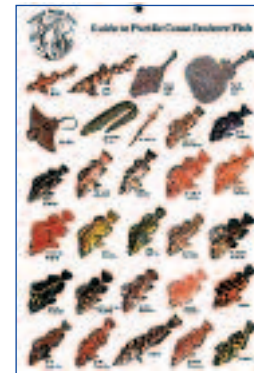
B530 PACIFIC COAST