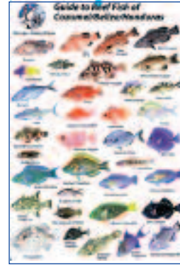
B534 COZUMEL BELIZE HONDURAS