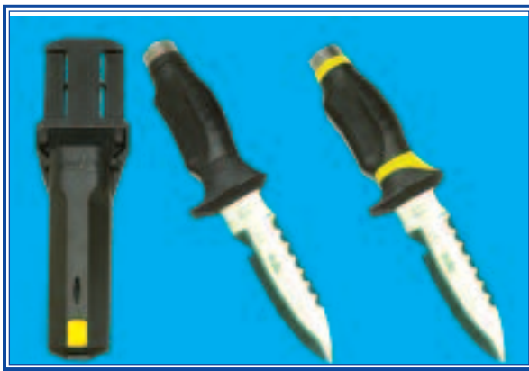
KN63 U.K. Hydralloy Blue tang drop point 4 1/2" Blade Black or yellow