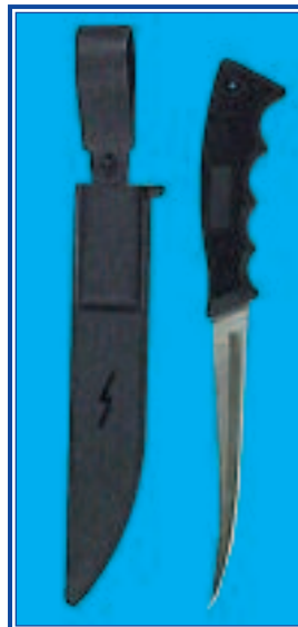
KN85 Filet knife 6" blade