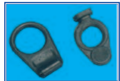
RP43 RP64 Knife retainer rings