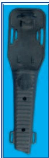
KN60 Sheath fits 4" - 5 3/4" Blades