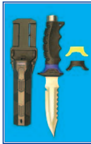
KN06 Sharp point dive knife with black, blue and yellow color inserts 5" blade