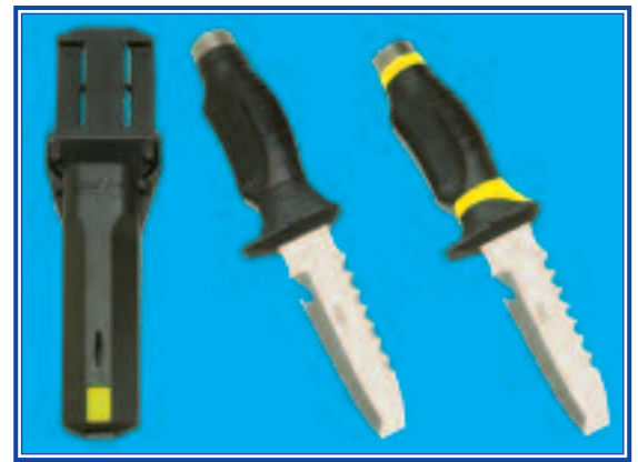
KN68 U.K. Hydralloy Blue tang blunt end 4 1/2" Blade Black or yellow