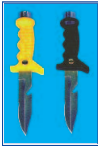
KN80 Button lock in blade with sheath Yellow or black 5" Blade