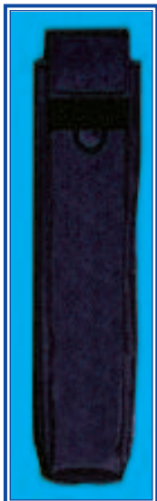
GB70 Nylon sheath works with most knives 4" X 12 1/2"