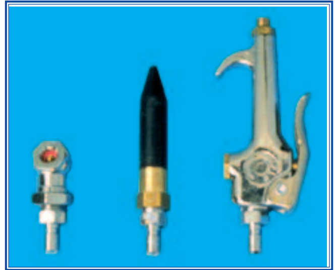
AA01 Tire inflator

Tech type tire inflators that connect into standard B.C.D. fittings Black, blue, gold, red or silver