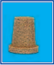
A197 Flat top filter 12mm H 10.8mm W