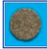
AA71 Standard filter 1.5mm H 12.4mm W