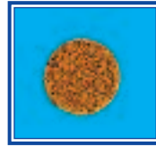
A164 DIN filter 2.05mm H 8.95mm W