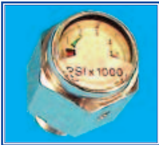
A120 Mini pony bottle high pressure 5000 psi gauge 7/16" threading