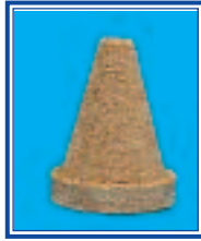
A176 Flat base fine filter 15.5mm H 12.4mm W