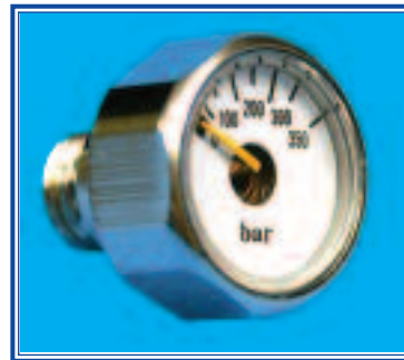
A232-Bar 350 bar mini gauge high pressure 7/16" threading