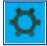
AA72 Star clip .3mm H 13mm W