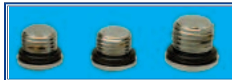
AA73 3/8" AA74 7/16" A175 1/2"