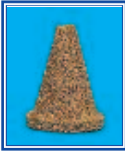
AA70 Conical course filter 15.7mm H 12.3mm W