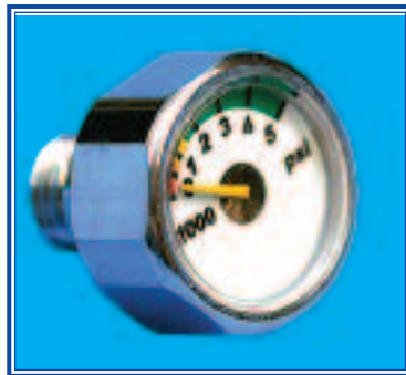
A232-PSI 5000 PSI mini gauge high pressure 7/16" threading