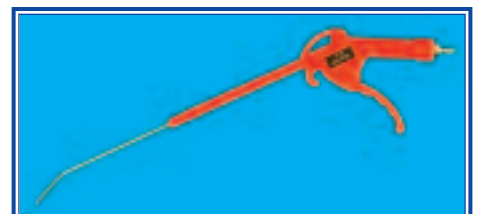
AA14 Air blaster with standard air fitting Has extender tube that delivers a strong stream of air and can be used inside tanks